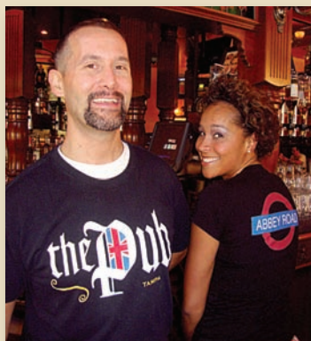
It's all British at The Pub!