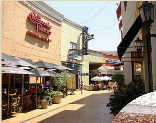
International Plaza has a fab restaurant row with shopping to match. Heaven!

"Porcini rubbed, duck confit croquets, Chianti jus, charred asparagus and roasted red peppers along with the