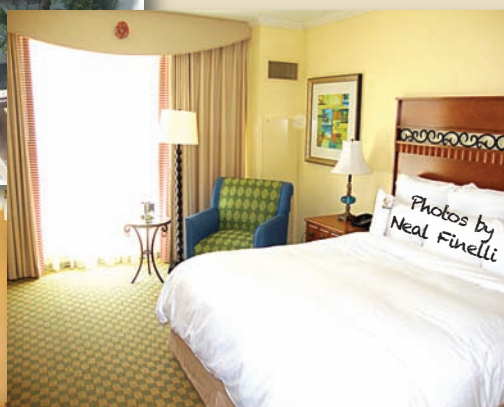
The Renaissance Tampa, a great hotel with an ideal location, fine dining and atmosphere

again. The staff were great, helpful and knowledgeable, sure in their